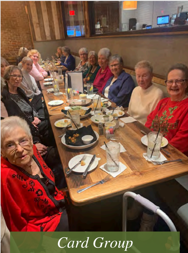
Card Group Christmas Luncheon

This last quarter has been crazy for a lot of reasons. Medicare open enrollment is always a little intense. New changes from Medicare each year, deadline dates to meet, a computer crash where contacts and forms were lost, many new clients and keeping the groups going all made life a little hectic at times, but we survived it.