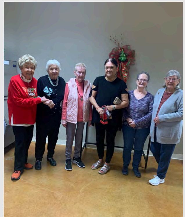
Jewelry, Knitting and Crochet Group

Our seniors have faced some serious hurdles this year. Most of them have made it through stronger and more resilient than ever. Our aging population is incredibly important. They are strong, wise, kind, sincere, honest, loyal, hard-working and smart. You would do well to spend time with them and listen to them. They are a wealth of knowledge.