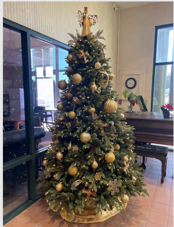
The Starkville office's Christmas tree greets everyone in the lobby during the holidays