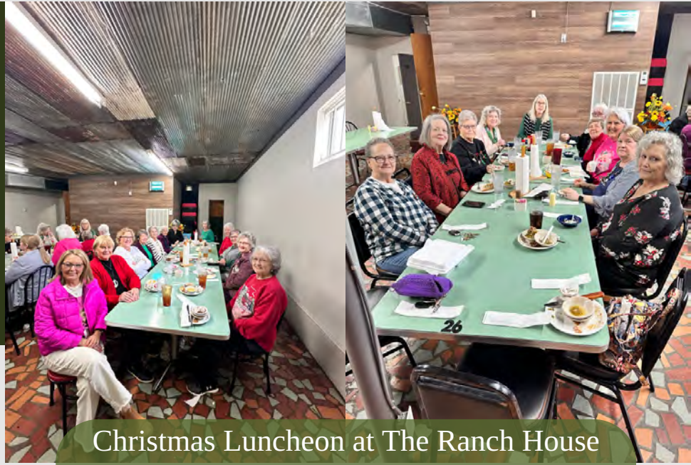
Christmas Luncheon at The Ranch House Columbus