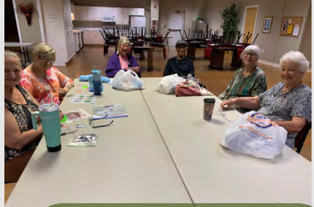
Columbus senior center's Tuesday ladies working on knitting, crochet, and stick-on jewel art projects.

We appreciate our hard-working staff so much!