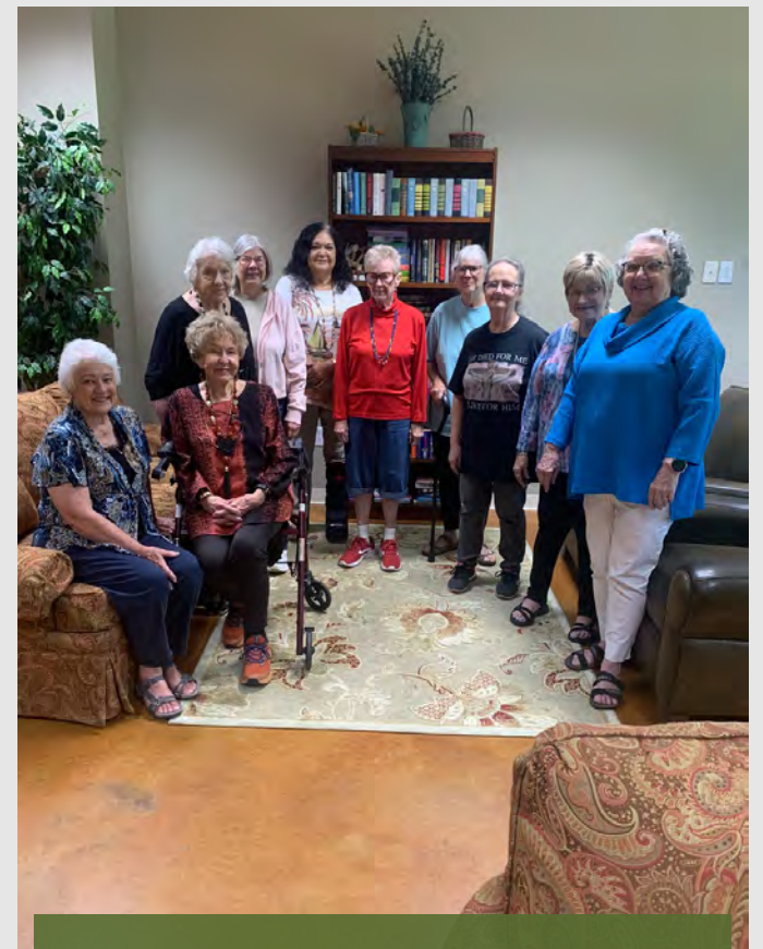
Knitting, Crochet and Jewelry Group