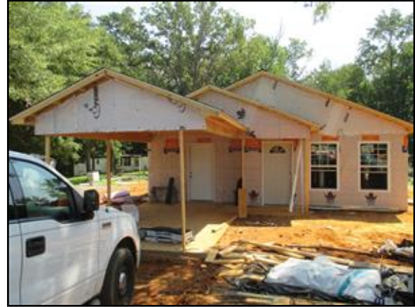
The Webster County Board of Supervisors 2012 HOME Project is underway. Construction has begun and recipients will move into their new homes in the next few months.