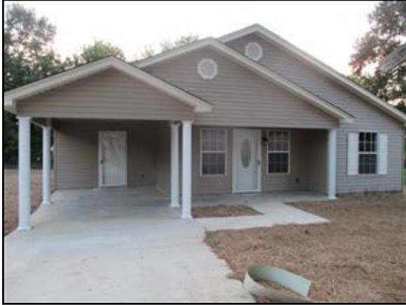
The Clay County HOME Project has completed construction on its final home. This project provided new homes for four families in Clay County.