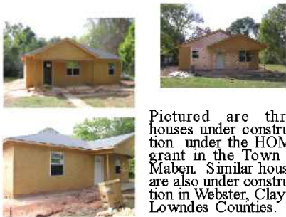
Pictured are three houses under construction under the HOME grant in the Town of Maben. Similar houses are also under construction in Webster, Clay & Lowndes Counties.