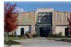
The GTPDD office is centrally located in Oktibbeha County in the Starkville Industrial Park