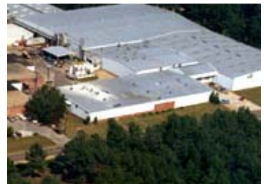
Close up of buildings highlighted in sketch.