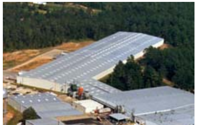
Photo of building highlighted in sketch